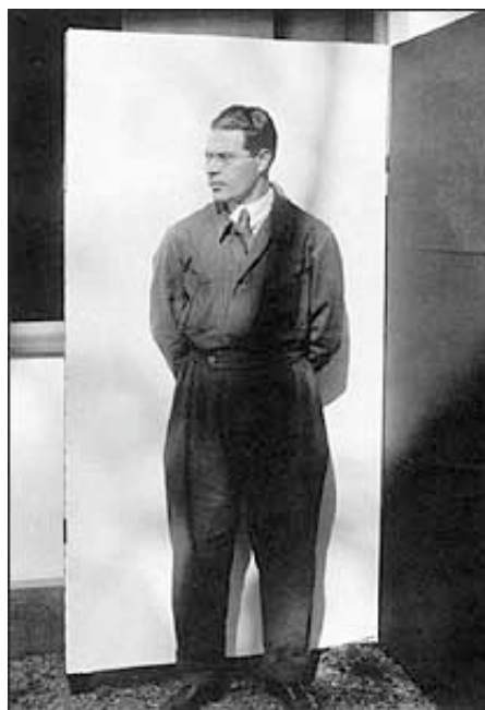
Fig. 3. Lucia Moholy, Portrait of Laszlo Moholy-Nagy, Dessau, photograph, 23x15.9 cm, 1926. (Reproduction, Bauhaus-Archiv, Berlin.) Lucia Moholy shot a portrait of the painter as a young Bauhaus master posing in the overalls that represented the workman's life.

Through a later call, the telephone paintings receive another calling. This is emblematic of the secondary role of a biographic writing practice that assumes a reality of its own and that estranges an artwork or its author from an original entitlement. Speaking against herself, Lucia Moholy senses how the margins creep into her notes via her telephonic reconsideration of Moholy. "The role played by industry, a secondary consideration for him to start with, gradually assumed in his mind a reality of its own, the metaphor of the telephone becoming the emblem of the day"[7]..